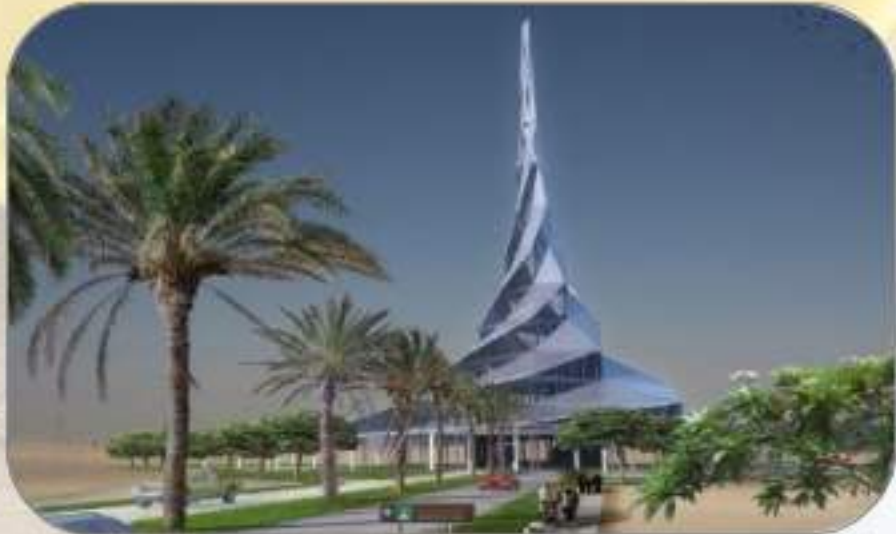
SOLAR INNOVATION CENTRE LEED Platinum 1st Government Building in the World to exceed 100 LEED credit points.