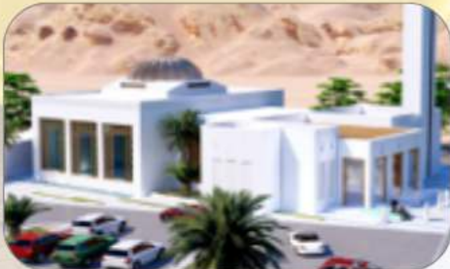
HATTA MOSQUE 1st LEED v4 PLATINUM Mosque in the World