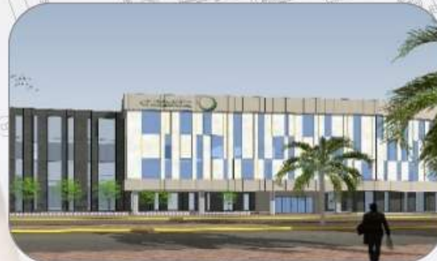
BMC OFFICE BUILDING LEED v4 GOLD