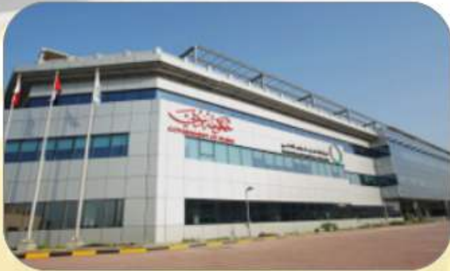
DEWA SUSTAINABLE BUILDING World's Largest LEED Platinum 1st Parksmart Pioneer in MENA Region