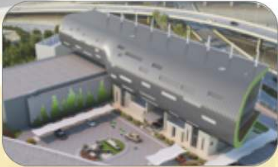
MORO HUB 1st LEED v4 Platinum Data center in the MENA Region