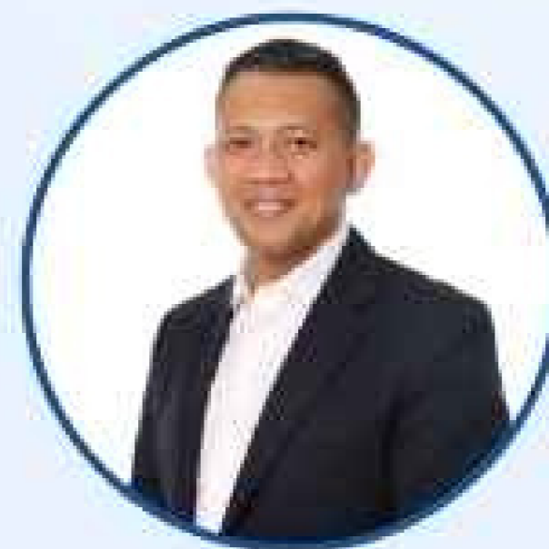
STRATEGIC DEVELOPMENT MANAGER