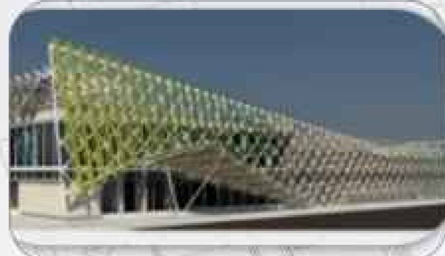
RESEARCH AND DEVELOPMENT CENTRE LEED Platinum