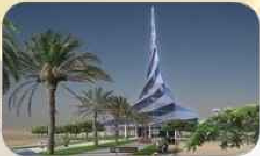
SOLAR INNOVATION CENTRE LEED Platinum 1st Government Building in the World to exceed 100 LEED credit points.