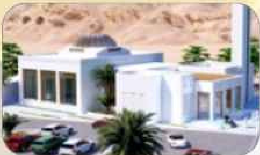
HATTA MOSQUE 1st LEED v4 PLATINUM Mosque in the World