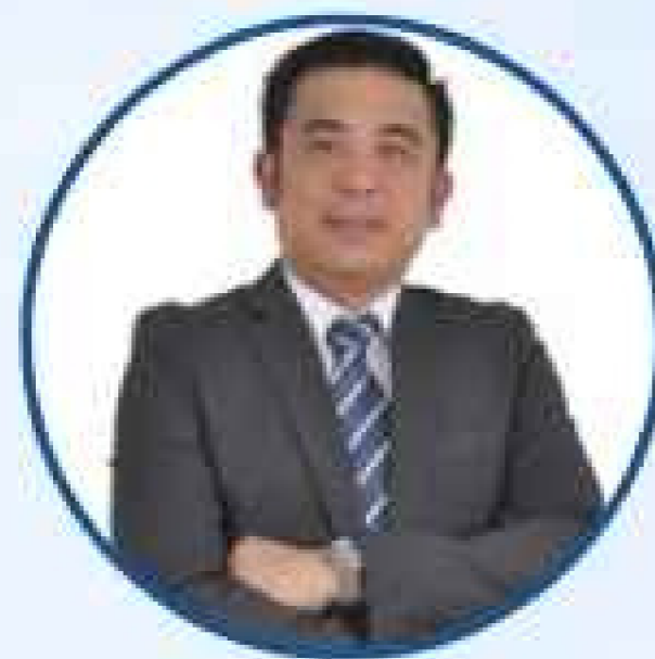
FOUNDER & CEO