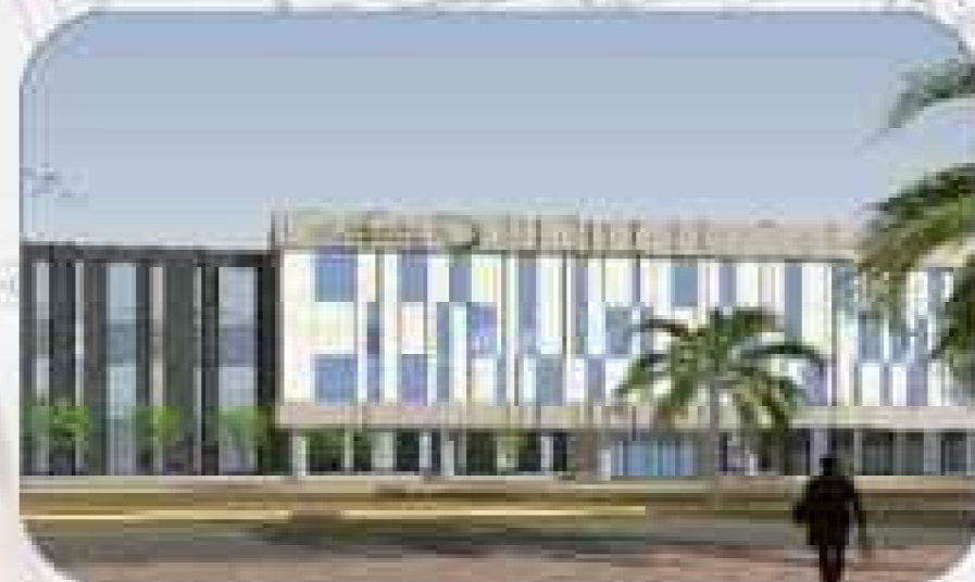
BMC OFFICE BUILDING LEED v4 GOLD