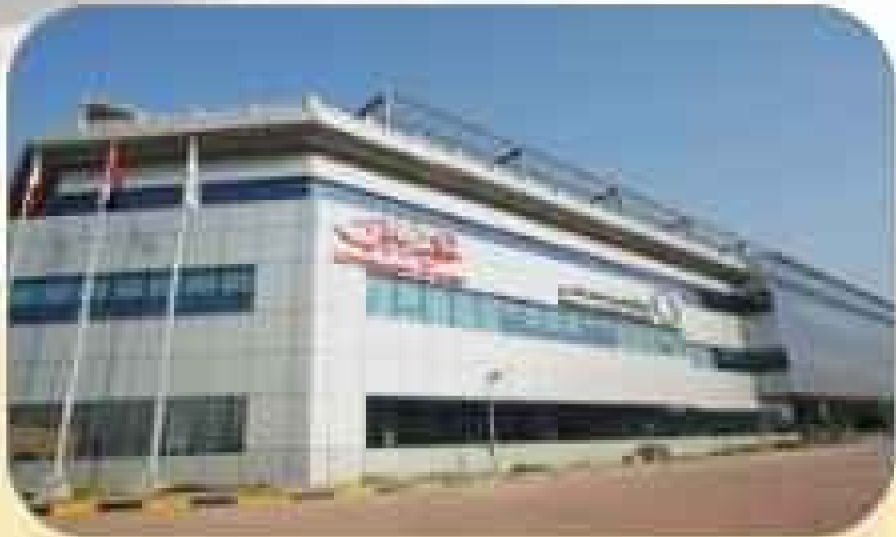
DEWA SUSTAINABLE BUILDING World's Largest LEED Platinum 1st Parksmart Pioneer in MENA Region