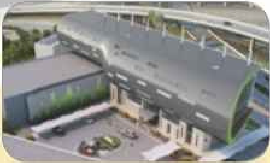
MORO HUB 1st LEED v4 Platinum Data center in the MENA Region